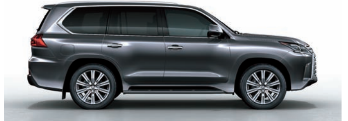
Basalt Mica | 1H9