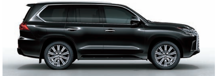
Starlight Black | 217