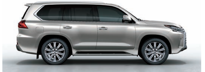
Metallic Silk | 4U7