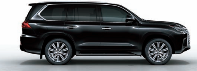
Classic Black | 202