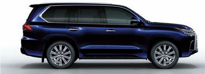
Deep Blue | 8X5