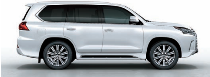
White Pearl | 077

The noble elegance of intriguing exterior colours and distinctive trim combinations exude a seductive and glamorous depth befitting 'The Ultimate Premium SUV'.