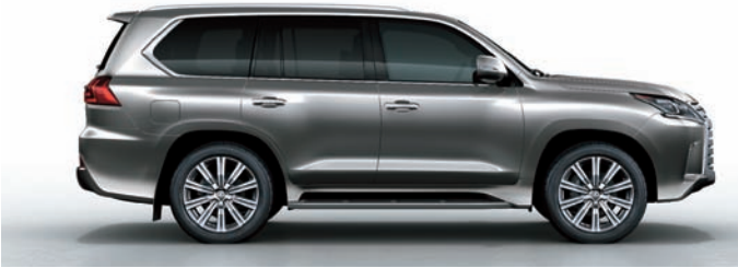
Titanium | 1J7