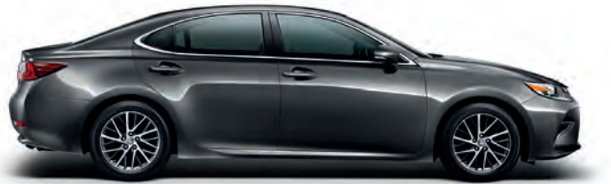
1H9 Basalt Mica