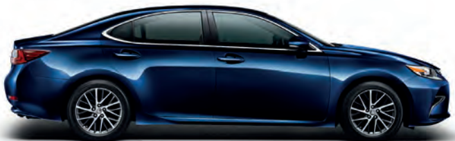
8X5 Deep Blue Mica