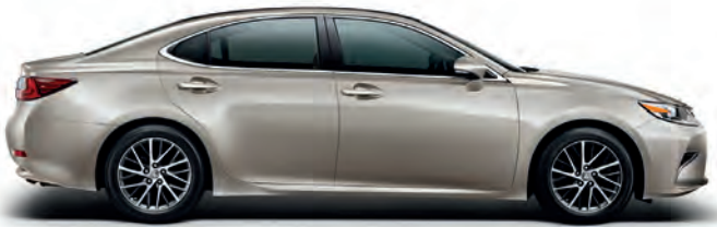
4U7 Metallic Silk Metallic