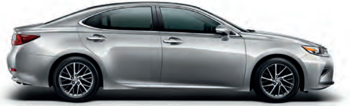
1J4 Platinum Silver