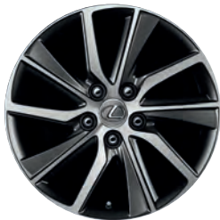
ES 300h - All models