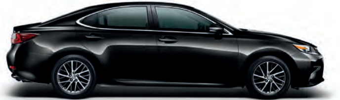
223 Graphite Black Glass Flake