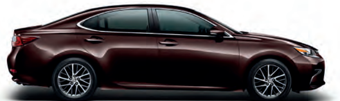
4X2 Deep Metallic Bronze Crystal Shine