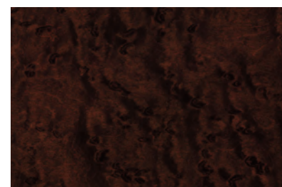
Birdseye Maple Wood trim LIMITED MODELS ONLY