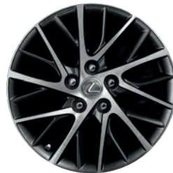
ES 350 Limited