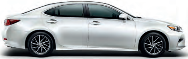
085 Sonic Quartz Crystal Shine