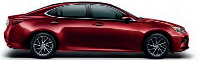
3R1 Burgundy Mica Crystal Shine