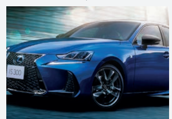
BLACK EXTERIOR SIDE MIRRORS & BLACK FRONT GRILLE