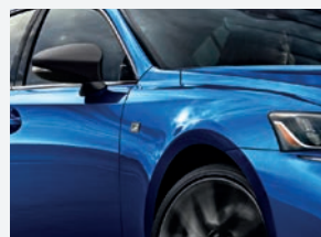
Cobalt | 8X1