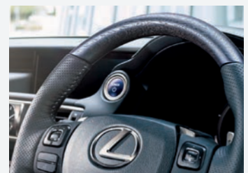
EXCLUSIVE HAND CRAFTED 'INDIGO BLUE' WOOD ACCENTED STEERING WHEEL