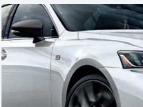
White Nova | 083