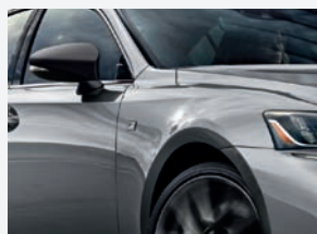
Manganese Lustre | 1K2