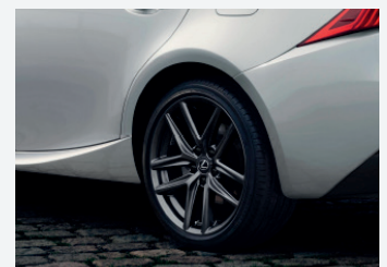
18" ALLOY WHEELS - BLACK CHROME FRONT 18 X 8; REAR 18 X 8.5