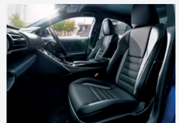
2-TONE NULUX SEATS - BLACK WITH GREY ACCENTS & BLUE-GREY CONTRAST STITCHING