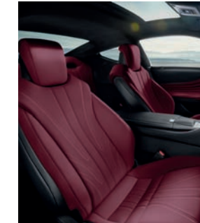
Dark Rose: GLASS ROOF Semi-aniline leather accented front; synthetic leather rear