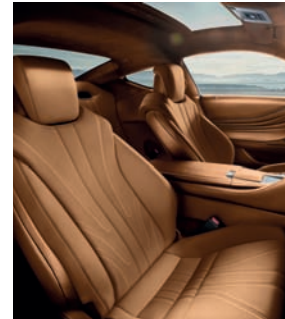
Ochre: GLASS ROOF Semi-aniline leather accented front; synthetic leather rear