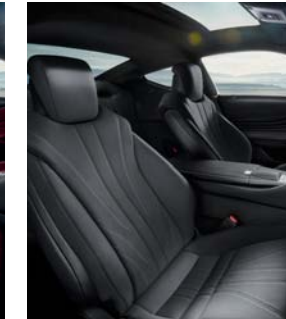
Black: GLASS ROOF Semi-aniline leather accented front; synthetic leather rear