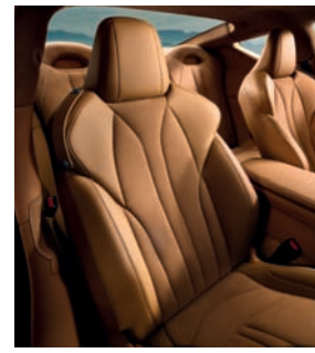
Ochre: SPORTS SEATS - CARBON ROOF Alcantara and semi-aniline leather accented front; Alcantara and synthetic leather accented rear