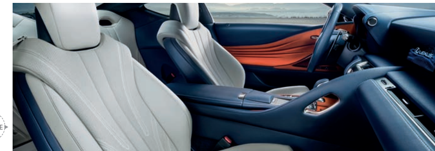
Steel Blue: Semi-aniline leather accented front; synthetic leather rear UNIQUE TO STRUCTURAL BLUE EXTERIOR COLOUR