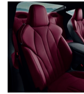
Dark Rose: SPORTS SEATS - CARBON ROOF Alcantara and semi-aniline leather accented front; Alcantara and synthetic leather accented rear