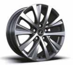
17-inch alloy wheels | ES 300h