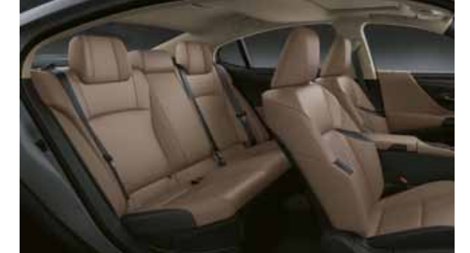
Chateau | ES 300h