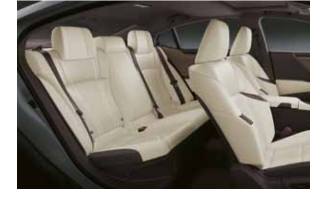
Rich Cream | ES 300h Limited