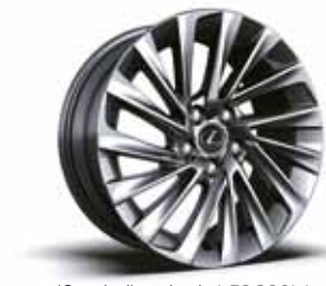
18-inch alloy wheels | ES 300h Limited