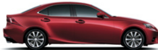
RED MICA CRYSTAL SHINE (3R1)