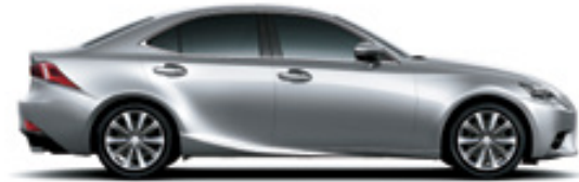
PLATINUM SILVER METALLIC (1J4)