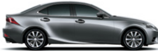
MERCURY GRAY MICA (1H9)