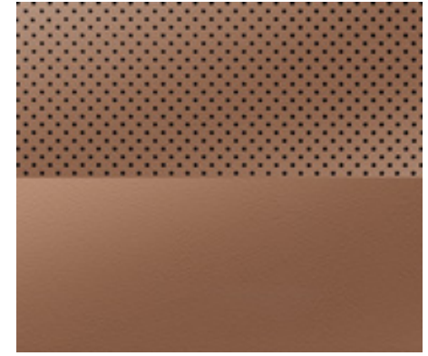
TOPAZ BROWN (54)