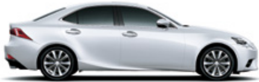
SONIC QUARTZ (085)