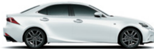
WHITE NOVA GLASS FLAKE (083) *F SPORT EXCLUSIVE