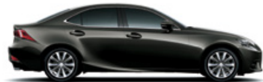
STARLIGHT BLACK GLASS FLAKE (217)