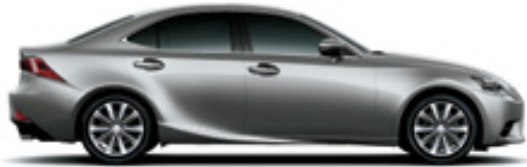
SONIC TITANIUM (1J7)