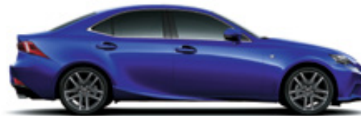
HEAT BLUE CONTRAST LAYERING (81) *F SPORT EXCLUSIVE

^ Not available for the F Sport package.