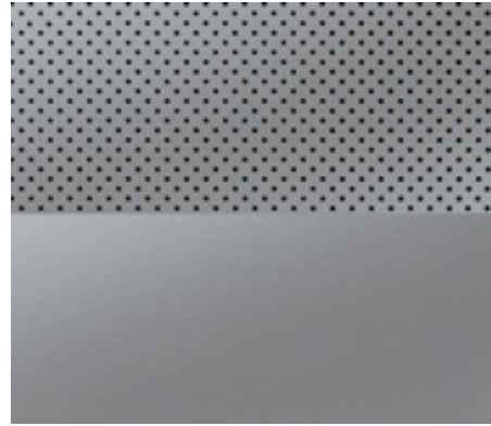
MOON STONE (14)