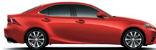
MADDER RED (3T2) ^