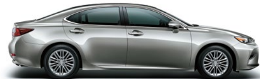
SONIC TITANIUM (1J7)