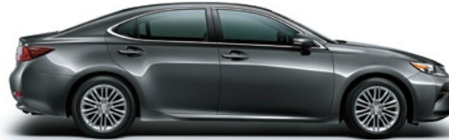
MERCURY GRAY MICA (1H9)