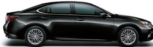
GRAPHITE BLACK GLASS FLAKE (223)