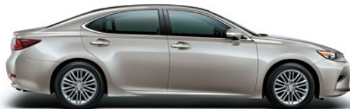
SLEEK ECRU METALLIC (4U7)