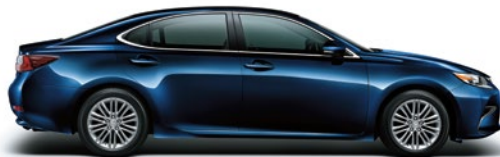
DEEP BLUE MICA (8X5)

Note: Vehicles pictured and specifications detailed in this catalogue may vary from models and equipment may vary. Please enquire with our Sales Consultants for the exact colour availability. * Vehicle body colour, interior colours and features might differ slightly from the printed photos in this catalogue.