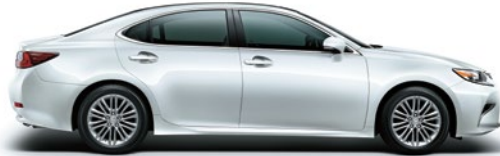
SONIC QUARTZ (085)