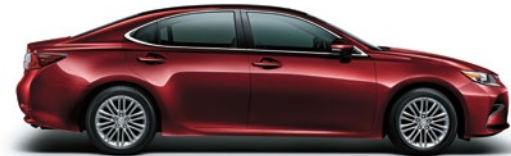
RED MICA CRYSTAL SHINE (3R1)