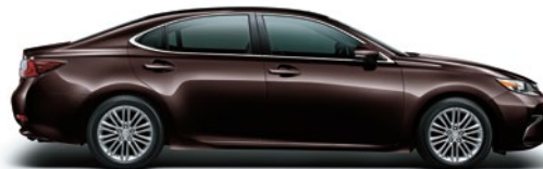
AMBER CRYSTAL SHINE (4X2)