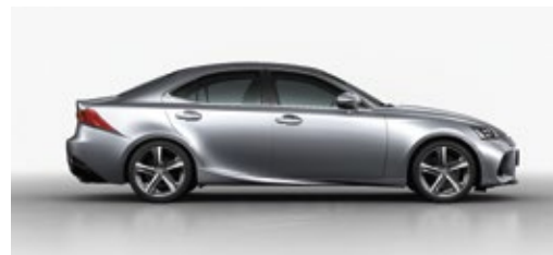
Platinum Silver Metallic