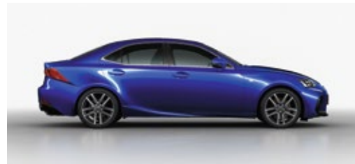
Heat Blue Contrast Layering