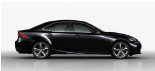
Graphite Black Glass Flake