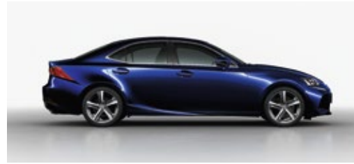
Deep Blue Mica