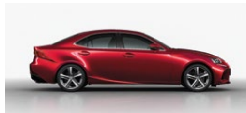
Red Mica Crystal Shine