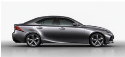
Mercury Gray Mica