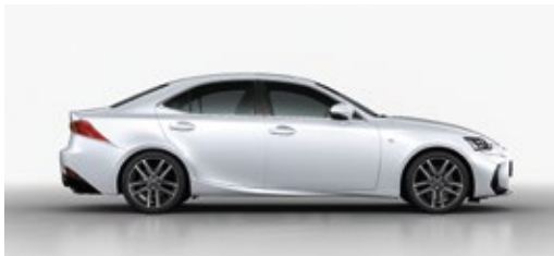
White Nova Glass Flake